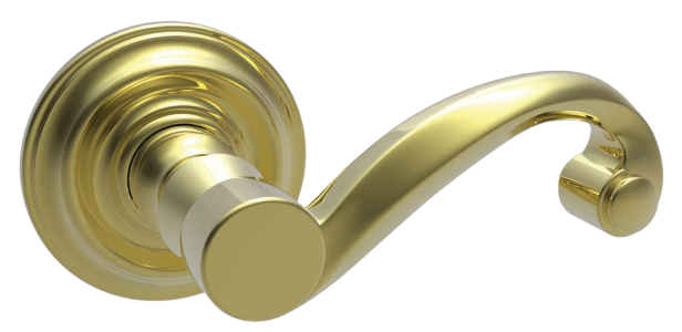
Curved Lever 8826 Large Colonial Rose 8851-262