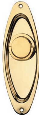
82040 Drop Ring